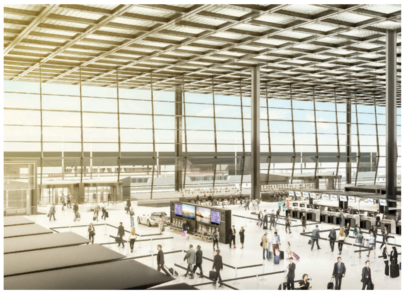
The design of the building and room automation for the check-in hall in the new Terminal 3 at Frankfurt Airport is done with the electrical CAD solution from WSCAD.

WSCAD is part of the Buhl group with more than 800 employees. WSCAD has been developing electrical CAD solutions for three decades. Customers include medium-sized companies, international corporations and engineering service providers. More than 35,000 users rely on WSCAD software as their electrical CAD solution. The software is based on one core platform that covers six engineering disciplines: Electrical Engineering, Cabinet Engineering, Piping and Instrumentation, Fluid Engineering, Building Automation and Electrical Installation. Any change made to a component in one discipline immediately reflects in all the other disciplines. WSCAD methodologies for standardization, reuse and automation significantly reduce engineering time from several weeks to just a few hours or even minutes. At the same time, these practices also ensure a much higher quality of work.