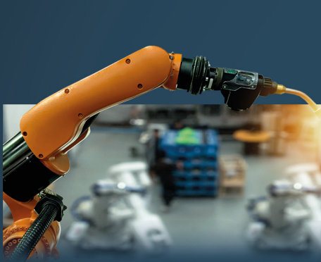
Machinery and Plant Engineering