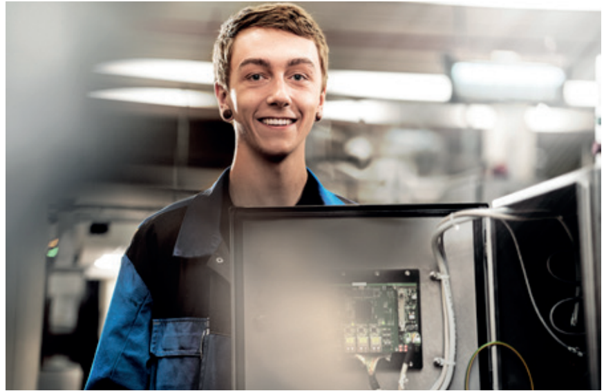
Smaller control cabinets and line components are designed and built by the Freyburg team independently, supported by WSCAD’s electrical CAD software.