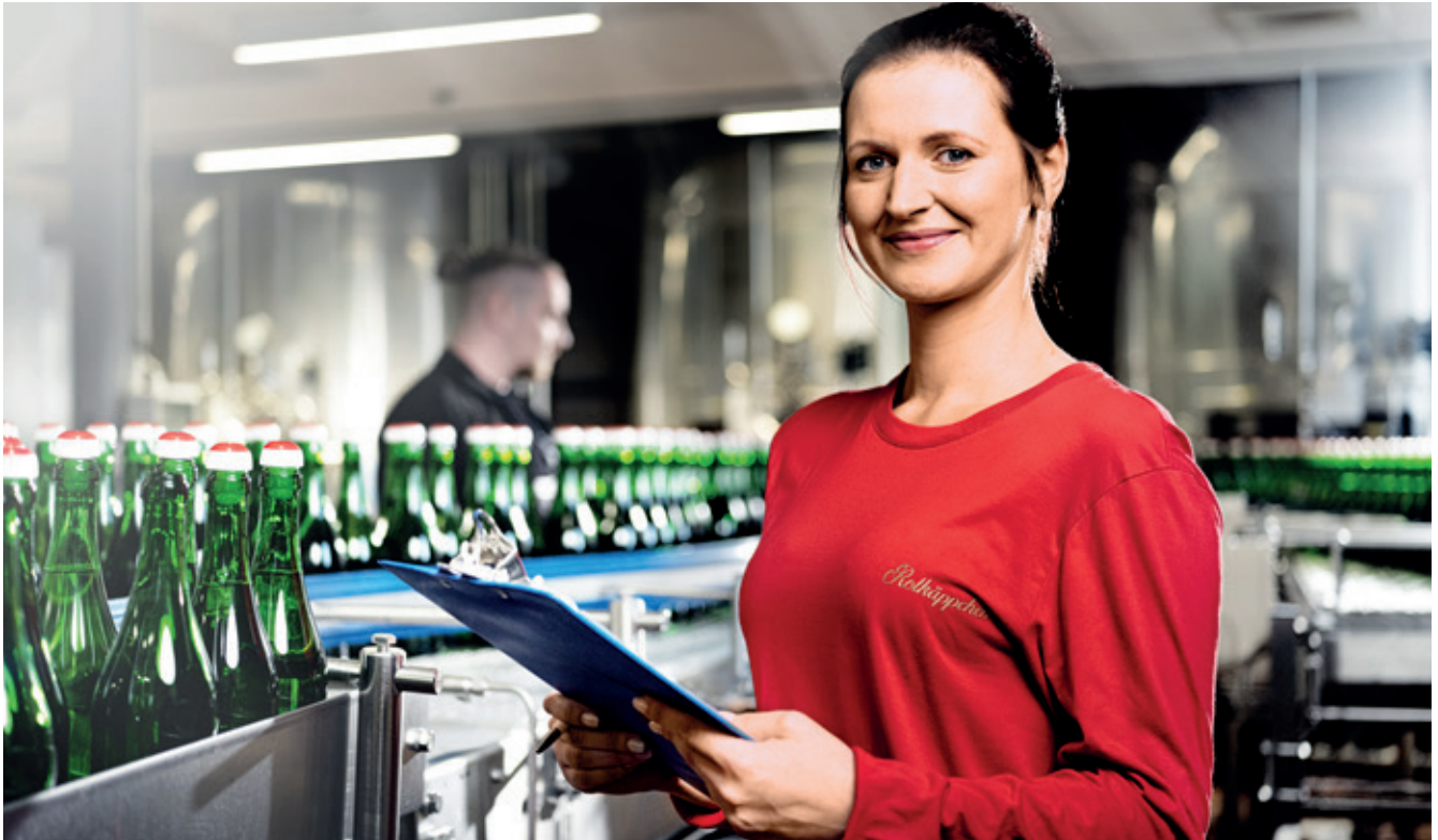
With nearly 600,000 bottles daily, flawless operation of Rotkäppchen's two filler lines is a top production success driver.

“ Even though redrawing schematics takes effort, WSCAD makes it fast, and the resulting benefits are substantial.”