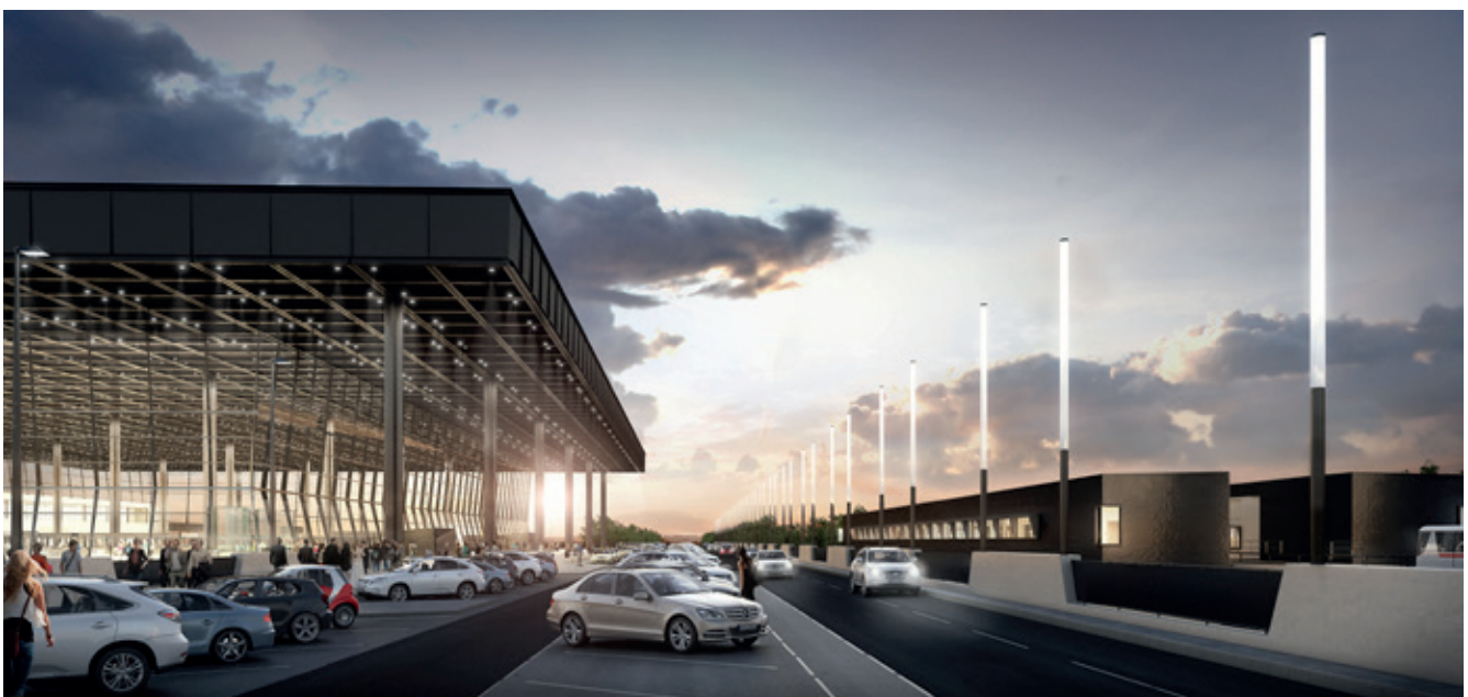
The arrival and departure area of the new Terminal 3 at Frankfurt Airport, with a Passenger Transport System (PTS) station in the background

"We didn't know this building automation software, but we came to appreciate it, because of the short training period needed to work fast and effectively with it".