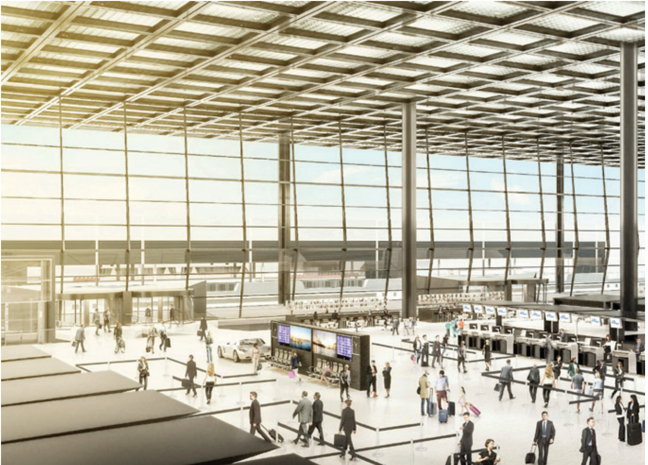
The design of the building and room automation for the check-in hall in the new Terminal 3 at Frankfurt Airport is done with the electrical CAD solution from WSCAD.

WSCAD is the world's first provider of AI-powered electrical CAD software and has specialised in electrical design solutions for over 35 years. On a seamless platform with a centralised database, WSCAD unites six disciplines – from electrical engineering and cabinet design to building automation. AI features boost efficiency, enable automation, and make complex tasks accessible even to less experienced users.